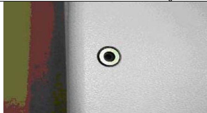
Fitting channel bars to canopy shell

Apply a silicone bead to lower corner of Dia 25mm holes cut into the canopy shell.